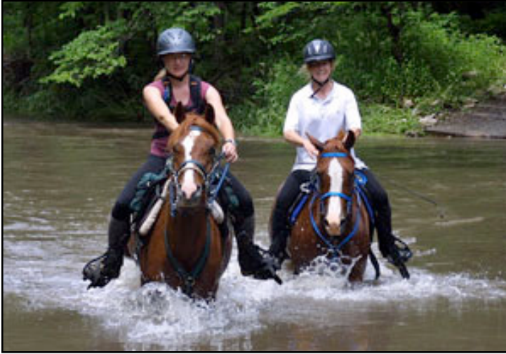
First crossing at S.E. 2009

S.E. Minnesota Ride continues Father's Day Tradition.